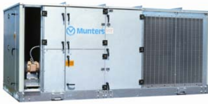
Humidity Control Unit